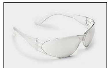
P1315FT Frost Frame