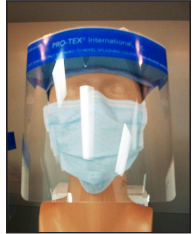
PRO-10-10 Full Face Shield