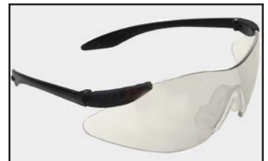
P1310BK Black Frame